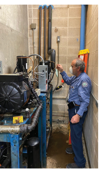
Clockwise from upper left: Winnetka Campus classroom renovation Northfield Campus roof upgrade Physical Plant Services staff works on mechanical upgrades Renovated Northfield Campus Library